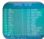
One-Button Channel Guide